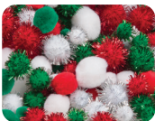
Assorted Christmas Pom Poms TH180