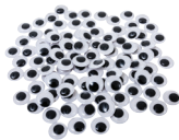
18mm Joggle Eyes SH1038