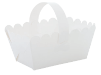
Easter Hunting Basket CS7213