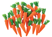
Mini Carrots SH1994