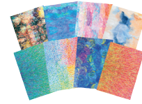
Impressionist Pattern Paper TH932